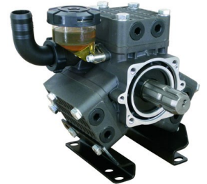
Udor high pressure diaphragm pumps