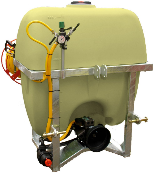
AL600-53 with Hose reel Option